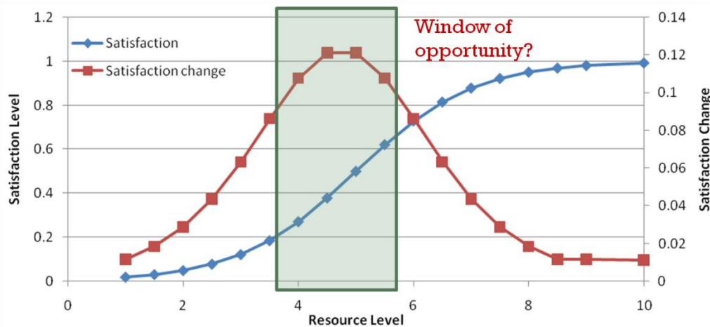
Figure 2. Satisfaction, willingness to engage in political action and resource levels are interrelated.

Agent motivation to become engaged in opinion and policy formulation is considered to be a function of perceived change in the environment and how satisfied an individual is with that change. As land is transformed from one state to another (e.g., traditional ranches to hobby ranches, hobby ranches to small ranchettes), natural resources are consumed and thus satisfaction levels change. Cultural amenities are assumed to increase as population increases. Agents must, therefore, make tradeoffs between natural and cultural amenities—an increase in their satisfaction of supplied cultural amenities requires a decrease in natural amenities. Coalitions of agents develop through social communication in an attempt to set land-use policies that maximize their satisfaction level (e.g., prevent the overuse of natural resources, increase cultural amenities). The level of cultural and natural amenities, together with land use policy, produces a feedback process that affects the kinds of agents that migrate into the systems. This set of interactions, agent motivation to promote policy change being contingent on the rate at which satisfactions levels change through time and the feedback processes that affect the opinion preference set of new agents, suggest that there may exist a limited window of opportunity to pass policies that sustain a particular level natural amenities (Figure 2).